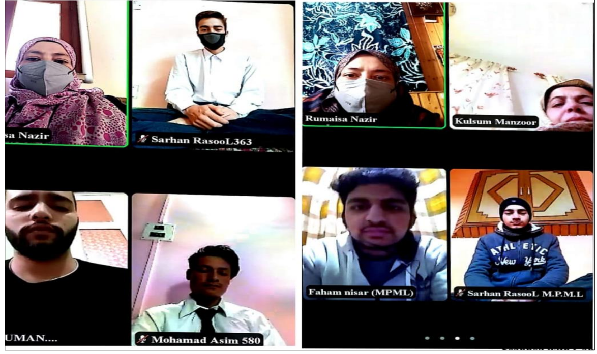
Zoom Classes during Covid-19